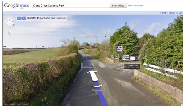
14. Following Devonshire Drive and Crane Cross Camping Park is the first Camping Site on the right. Please contact us for current prices as signage is out of date on these images.