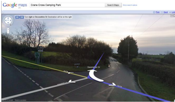
13. Turn right on to Devonshire Drive off A478.